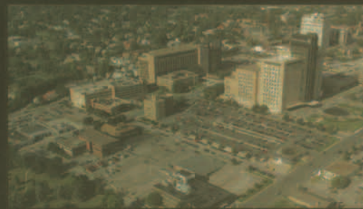
The old Mutual of Omaha campus.

Now it's looking at BUILDING FROM WITHIN .