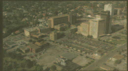
The old Mutual of Omaha campus.

Now it's looking at BUILDING FROM WITHIN .